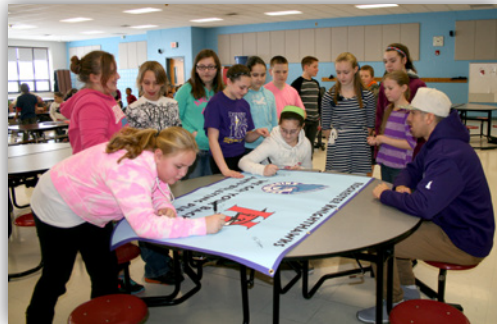
Students sign pledge