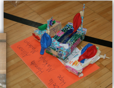
A sample of the cars that were created